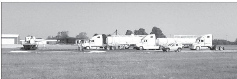
Runway grooving improves traction and water disbursement.

The runway overlay is now completed. The final improvements include grooving the runway for better water disbursement following a rain and improved braking for larger aircraft, repainting and marking the