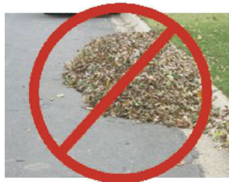
NO! Please do not place leaf piles in the street.

Please park vehicles off the street when possible) we will apply the same rules as for snow removal).