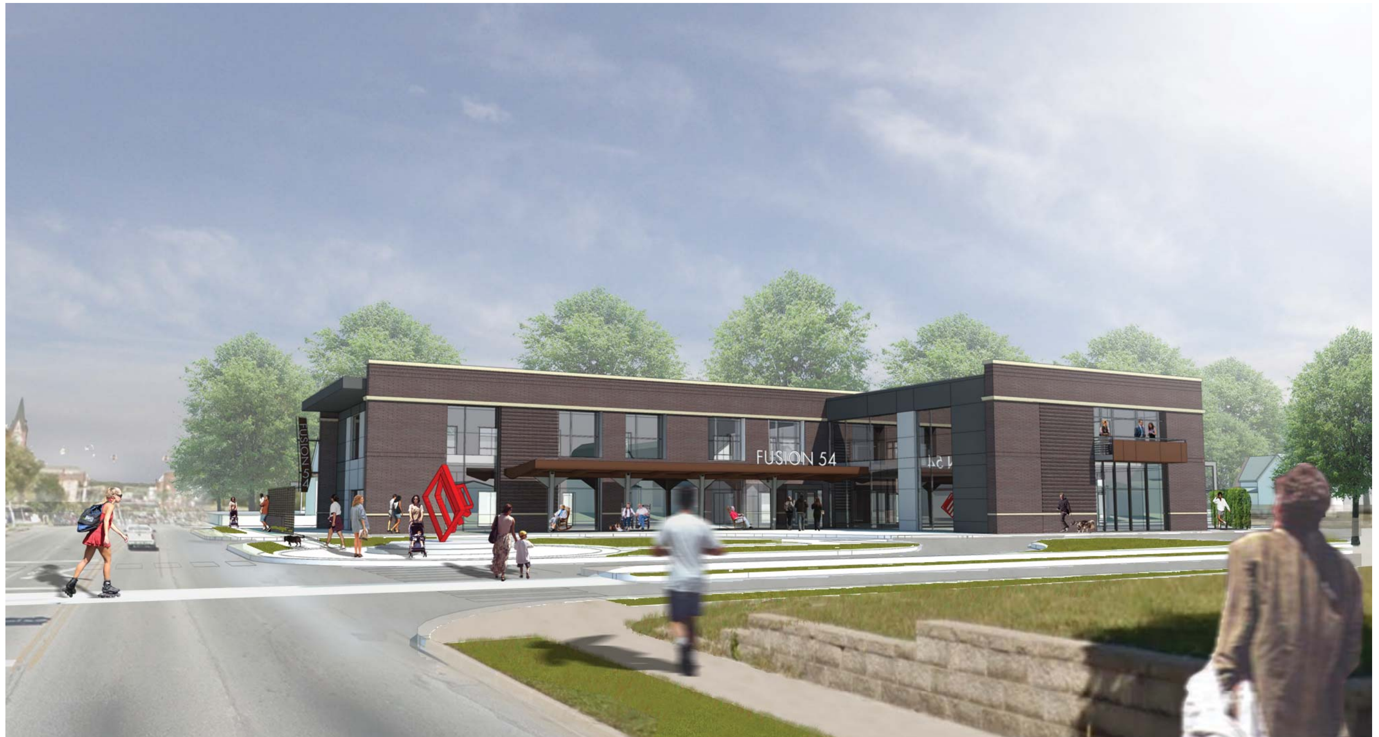
PERSPECTIVE FROM WASHINGTON ST